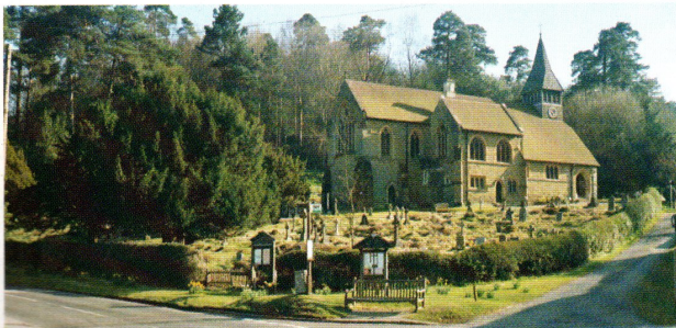
The church of St Mary has a surprising connection to the Crimean War